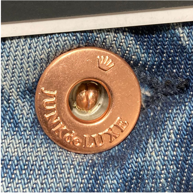
Shinny Brass finish - as 60-025014 sms