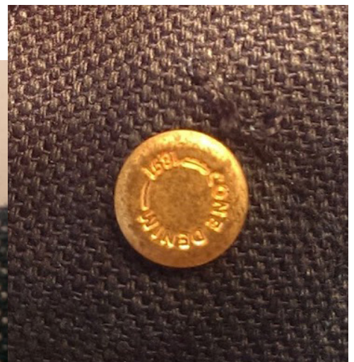
shank button bottom view