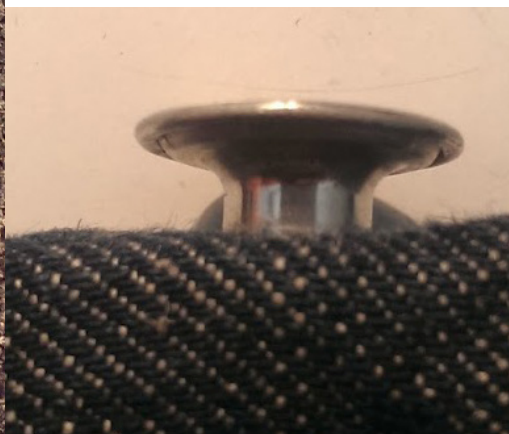
shank button side view