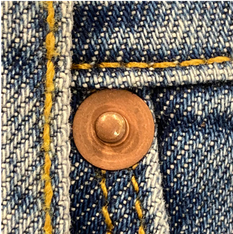
Dull Brass finish photo ref