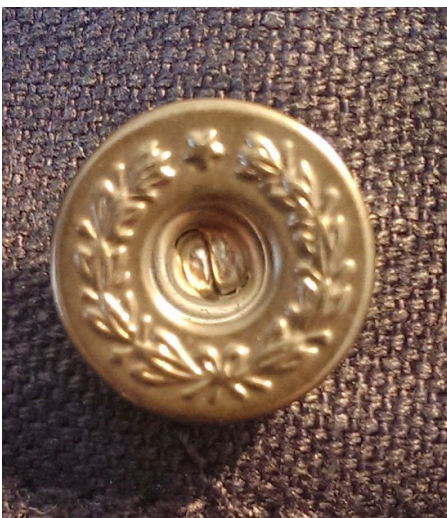
shank button face side