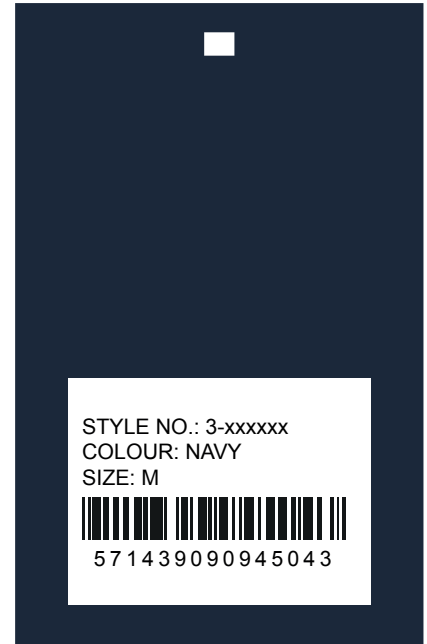
Barcode sticker for production

007-sales sample sticker See instruction