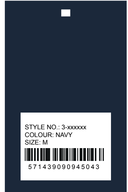
Barcode sticker for production back side

007-sales sample sticker See instruction