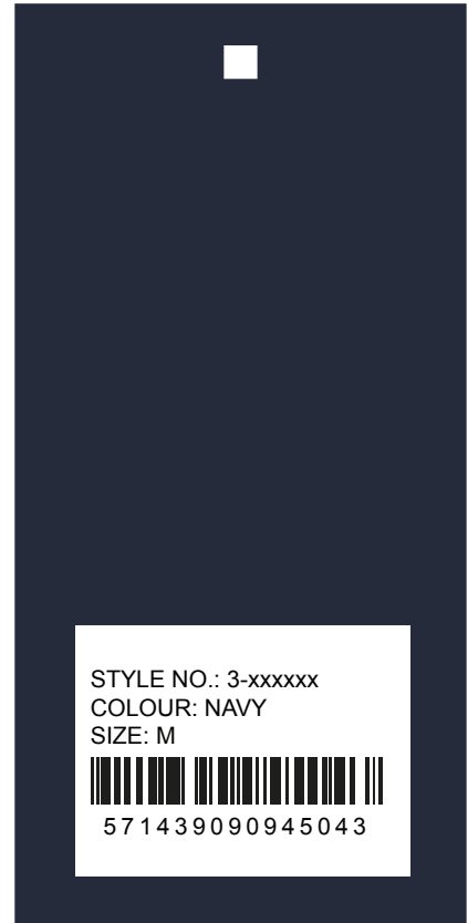
Barcode sticker for production back side

007-sales sample sticker See instruction