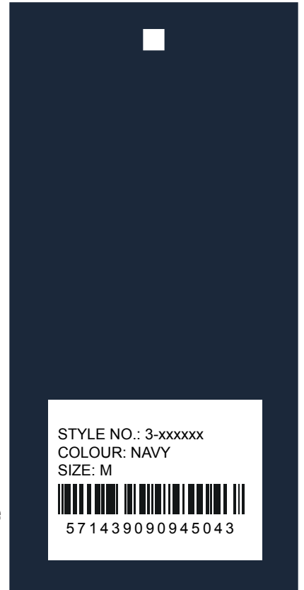
Barcode sticker for production back side

007-sales sample sticker See instruction