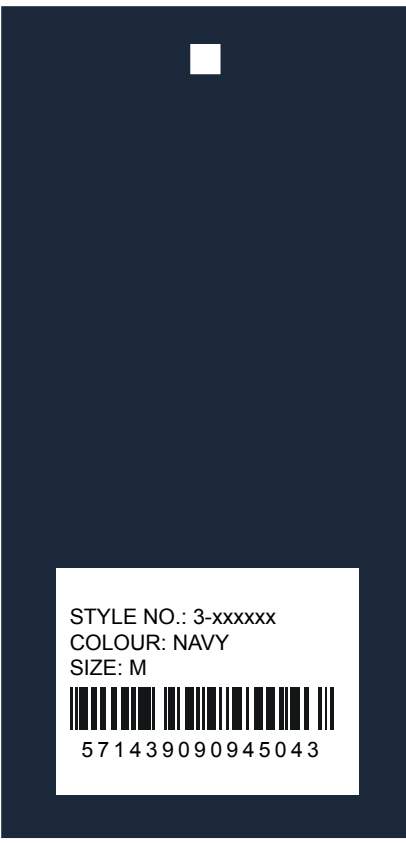
Barcode sticker for production back side

007-sales sample sticker See instruction