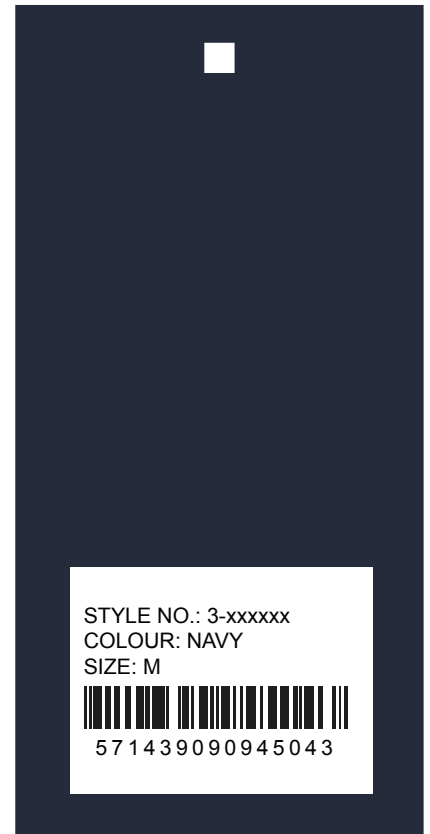
Barcode sticker for production back side

007-sales sample sticker See instruction